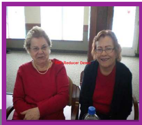
Family Friends And Fun!