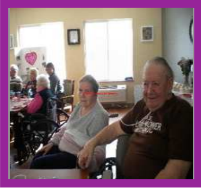
Love is in the Air!