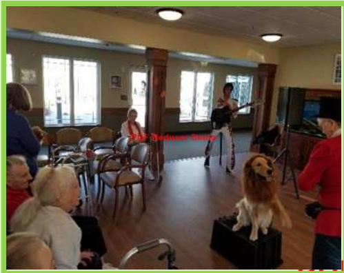
Ronan The Lion!

When a loved one encounters memory issues, unique challenges arise for the person affected and their family members. We at Jefferson Memory Care know the emotions they experience and the importance that human kindness plays in helping. We also believe that assuring the resident's personal dignity is the cornerstone of providing care